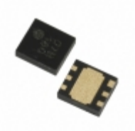
XC6124F520ER-G Torex Semiconductor Ltd. IC WATCHDOG TIMER 6-USP