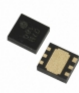
XC6124F519ER-G Torex Semiconductor Ltd. IC WATCHDOG TIMER 6-USP