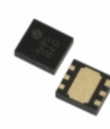
XC6124F517ER-G Torex Semiconductor Ltd. IC WATCHDOG TIMER 6-USP