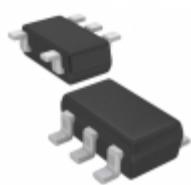
XC6124F518MR-G Torex Semiconductor Ltd. IC WATCHDOG TIMER SOT-25