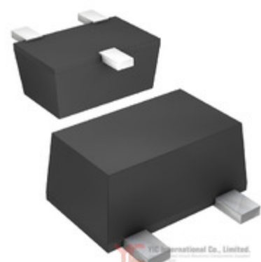
Image may be representation. See specs for product details.