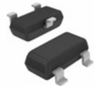
DTC143TCAHZGT116 LAPIS Semiconductor NPN 100MA 50V DIGITAL TRANSISTOR