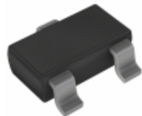
DTC143TCAT116 Rohm Semiconductor NPN 100MA 50V DIGITAL TRANSISTOR