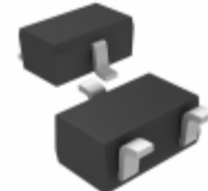
DTC143EUAT106 Rohm Semiconductor TRANS PREBIAS NPN 200MW UMT3